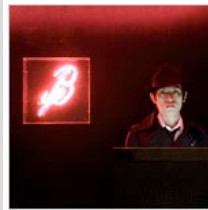
Tokyo's Hidden Nightspots